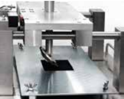
Device for high-heel test Fixing elements strength testing

with raised edge 4-piece sets; for left-side driving (5L1 061 550A; for right-side driving 5L2 061 550A)