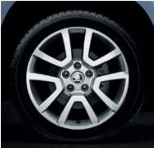
Alloy wheel 7.0J x 17" Spitzberg for tyre 225/50 R17 in silver design (5L0 071 497F 7ZS)