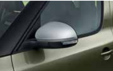
Side mirror covers - aluminium look When purchasing a Yeti vehicle you can decide between three designs of side mirror covers. The basic black variant can be replaced with covers in the colour of the body, or in silver with an aluminium look. Silver mirrors are standard for the Yeti Outdoor model (5L0 071 719)