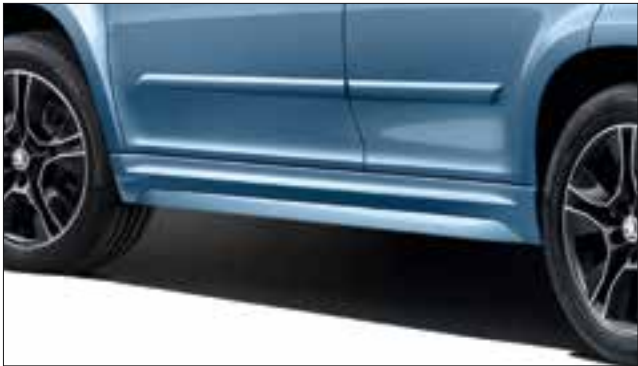
Side doorsill covers Sturdy doorsill covers for even more dynamic look of your Yeti (5L0 071 685A)