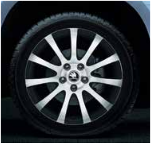
Alloy wheel 7.0J x 17" Annapurna for tyre 225/50 R17 in glossy black design (5L0 071 497D JX2)