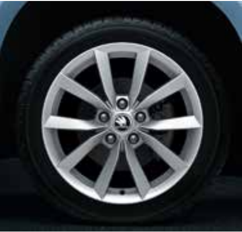
Alloy wheel 7.0J x 17" Scudo for tyre 225/50 R17 in silver design (5L0 071 497M 8Z8)