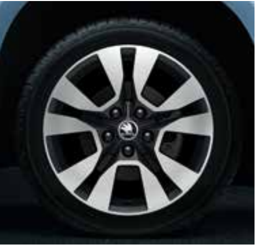
Alloy wheel 7.0J x 17" Origami for tyre 225/50 R17 in glossy black design (5L0 071 497K FL8)