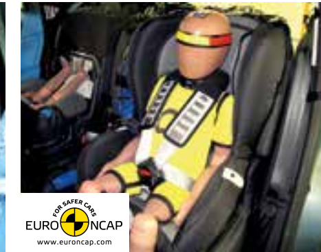
Original ŠKODA child seats successfully passed the Euro NCAP tests.