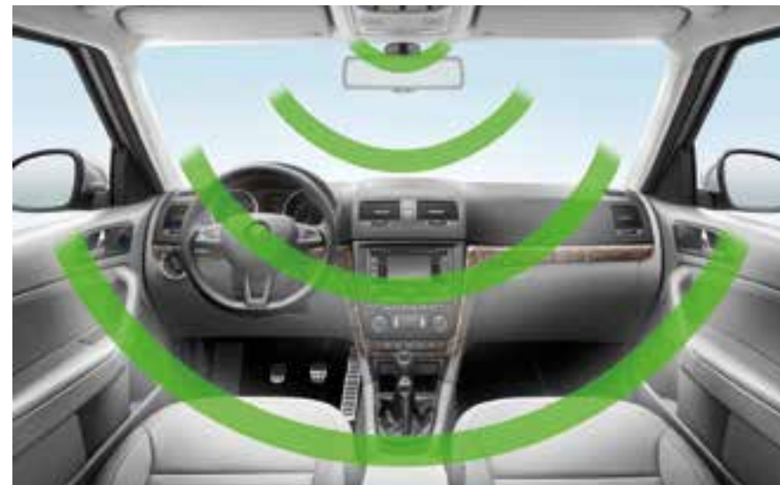
Alarm system with interior monitoring is equipped with advance resource to ensure the system's functionality after disconnecting the battery. Activates automatically after locking the car and monitors all doors, engine lid, ignition switch and vehicle interior. If there is an unallowable interference, control unit launches all directional lights and siren. Audio alarm lasts 25 seconds and can be induced repeatedly up to 10 times in a row. Basic alarm kit for cars with serial remote control of central locking (BKA 700 001); basic alarm kit for cars without serial remote control of central locking (BKA 700 002); mounting kit for alarm (BKA 630 001)