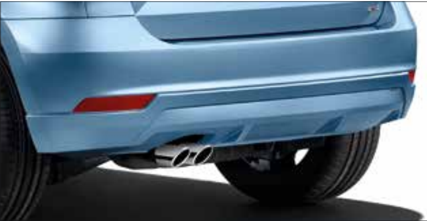
Rear spoiler In combination with the front spoiler, it helps the Yeti to fulfil its sporty ambitions (5L6 071 610 for cars without serial preparation for the tow bar; 5L6 071 610A for cars with serial preparation for the tow bar)