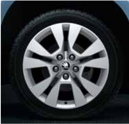
Alloy wheel 7.0J x 17" Origami for tyre 225/50 R17 in silver design (5L0 071 497L 8Z8)