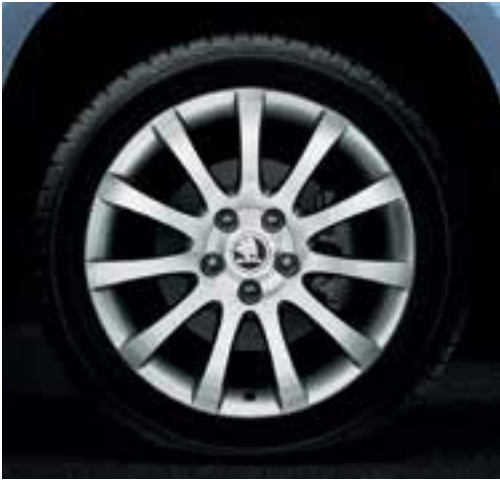
Alloy wheel 7.0J x 17" Annapurna for tyre 225/50 R17 in silver design (5L0 071 497C 7ZS)