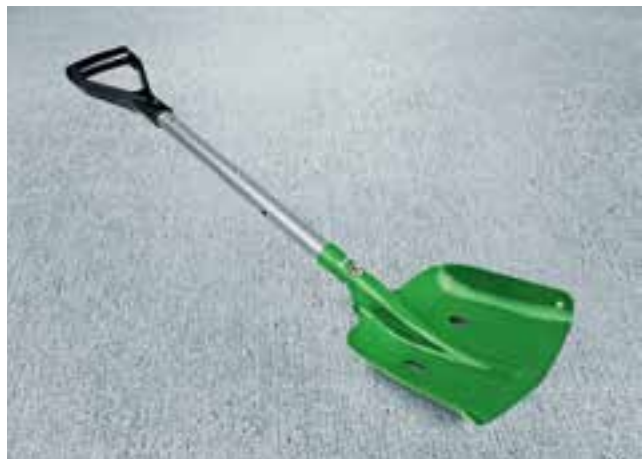
Foldable snow shovel made of alloy, weight 750 g, 3-part, including practical textile cover (5L0 099 320)