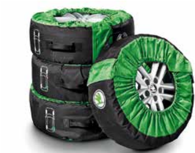
Complete wheels cover Handy set of covers for wheels up to 18" and 45 mm width. Made of high-quality polyester, and their sturdy handles make transporting and carrying the wheels easy (000 073 900B)