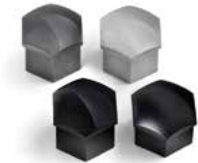
Screw covers* for more aesthetic look of the wheels; silver-grey matt (1Z0 071 215 Z37); for wheels with safety bolts 000 071 597 C (1Z0 071 215A Z37); silver-grey glossy (1Z0 071 215 U27); silver metallic (1Z0 071 215 7ZS); black glossy (1Z0 071 215 9B9); black matt (1Z0 071 215 01C); for wheels with safety bolts 000 071 597 C (1Z0 071 215A 01C)