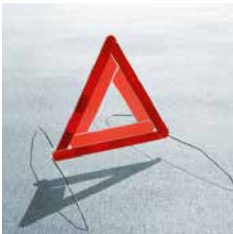
A handy, stable and highly visible warning triangle with foldable metal feet for emergency use on the roadway (GGA 700 001A)