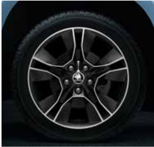
Alloy wheel 7.0J x 17" Blossom for tyre 225/50 R17 in glossy black design (5L0 071 497A JX2)