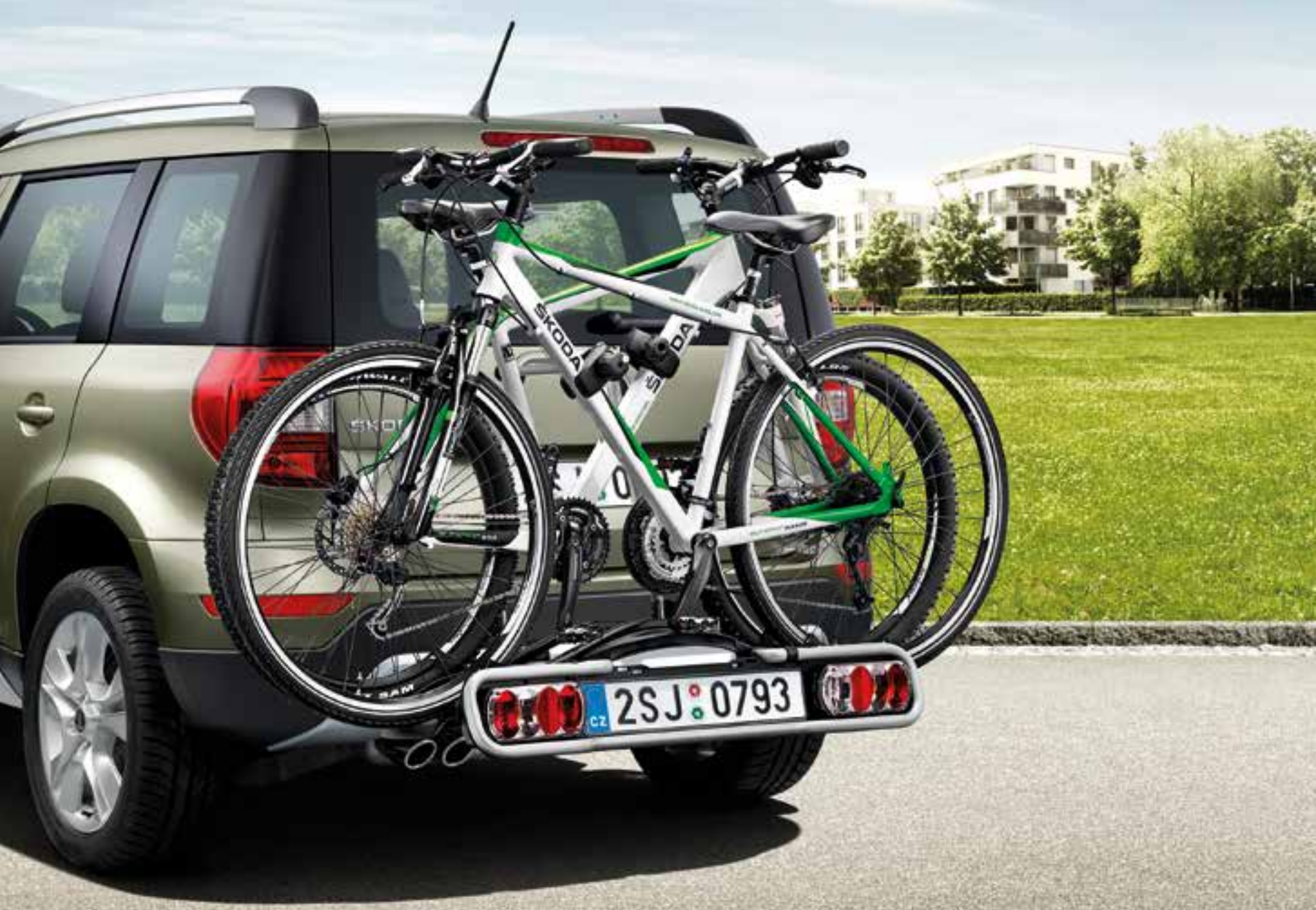
Bicycle carrier for a tow bar can hold two bicycles weighing up to 25 kg each. Lockable bolts permit flexible handling and better anchoring (000 071 105B)