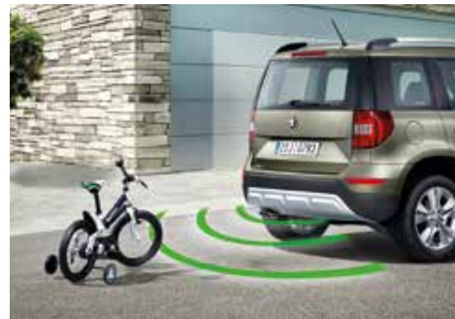
Rear parking sensors for monitoring distance of vehicle from potential obstacles. If there is an obstacle at a distance of 140 cm from the rear of the car, it is signaled by short beeps at intervals of one second. This interval is continuously shortened with the approach to the obstacle. When approaching 30 cm, beeps turns into unbroken tone (BKA 600 003A)