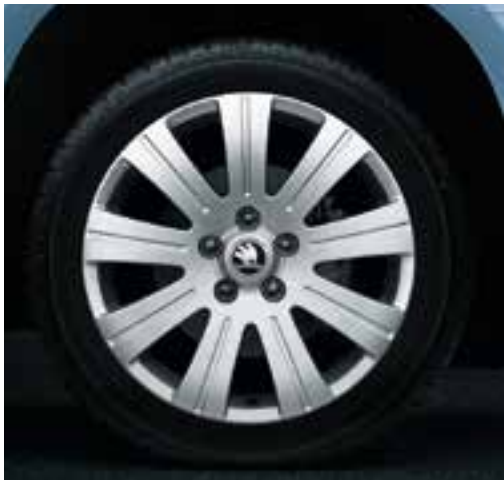
Alloy wheel 6.0J x 17" Flash for tyre 205/50 R17 in silver design (5E0 071 497B 7ZS)