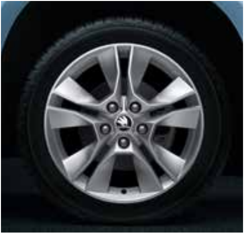
Alloy wheel 7.0J x 17" Blossom for tyre 225/50 R17 in silver design (5L0 071 497A 8Z8)