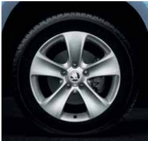
Alloy wheel 7.0J x 16" Moon for tyre 205/55 R16 in silver design (3T0 071 496A 7ZS)