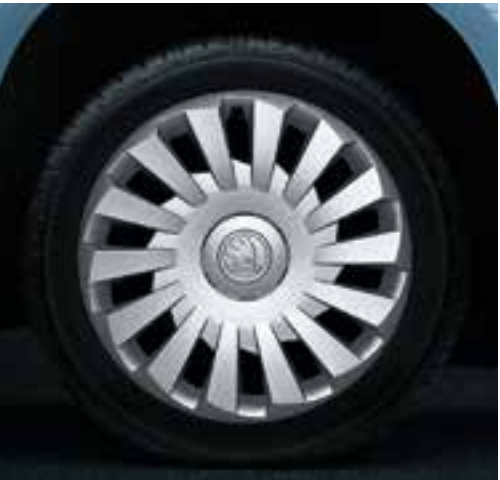
Hub covers Nordic for wheel 6.0J x 16"; 4-piece set (5E0 071 456)