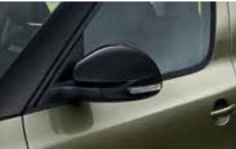
Side mirror covers in black design Side mirror covers in black metallic design (5L0 072 530)