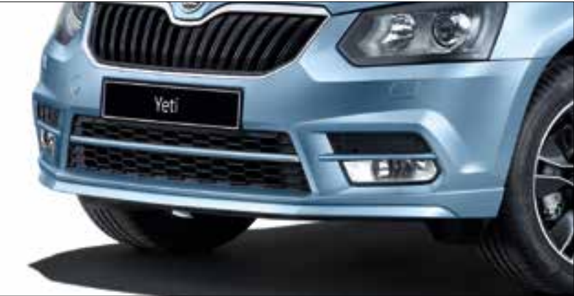
Front bumper spoiler for a sportier appearance at the vehicle's front(5L0 071 609)