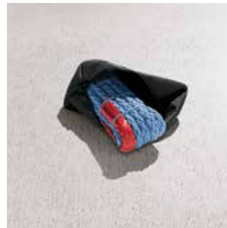
Tested tow rope permits towing of vehicles weighing up to 2,500 kg (GAA 500 001)