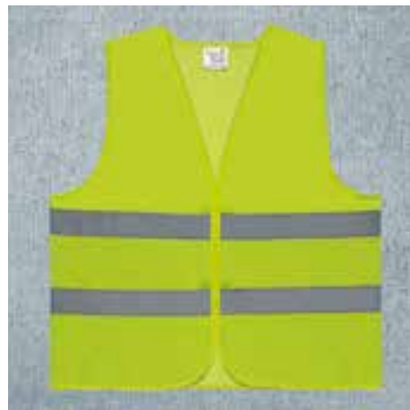
Lightweight reflective safety vest of 100% polyester in fluorescent yellow colour comes in a textile carrier. An important part of the vehicle's safety equipment (3T0 093 056); offered also in orange colour (XXA 009 001)