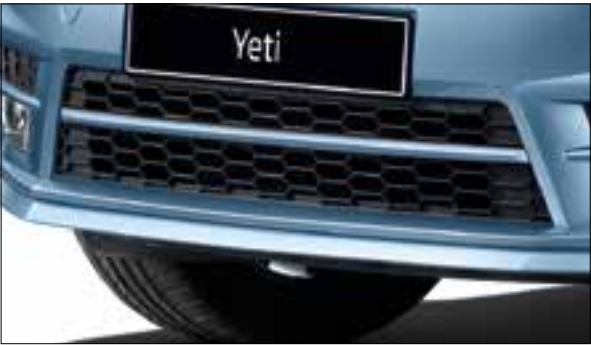
Decorative front spoiler strip A strip lacquered in the vehicle's colour for a stylish addition to the vehicle's visage (5L0 071 004A)