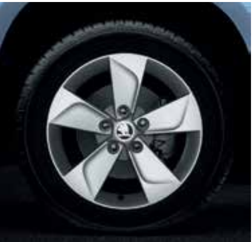
Alloy wheel 7.0J x 16" Nevis for tyre 205/55 R16 in silver design (5L0 071 496A 8Z8)