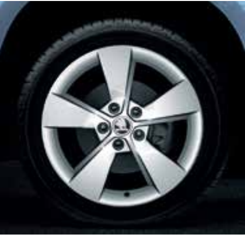
Alloy wheel 7.0J x 17" Erebus for tyre 225/50 R17 in silver design (5L0 071 497J 8Z8)