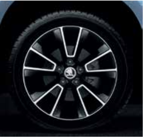
Alloy wheel 7.0J x 17" Matterhorn for tyre 225/50 R17 in glossy black design (5L0 071 497H FL8)