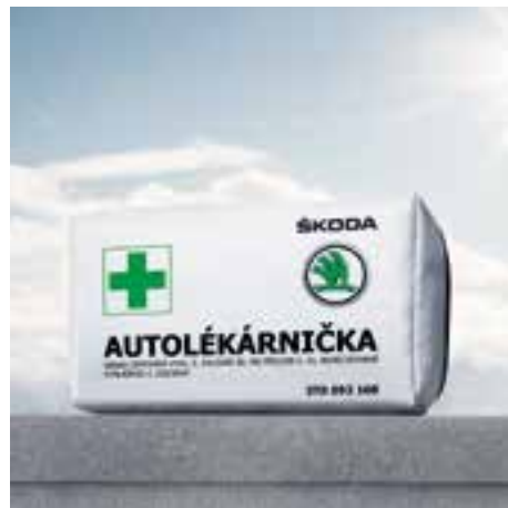
First aid kit with contents conforming to amended Decree No. 216/2010 (GFA 410 010DE)