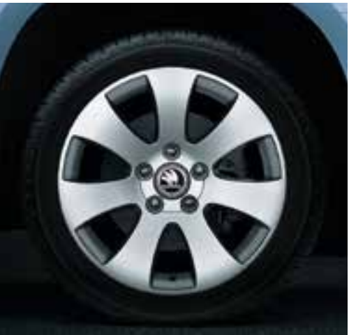
Alloy wheel 7.0J x 16" Spectrum for tyre 205/55 R16 in silver design (3T0 071 496 7ZS)