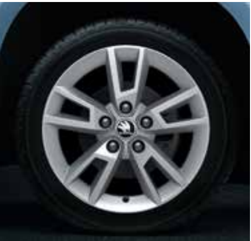
Alloy wheel 7.0J x 16" Forrest for tyre 205/55 R16 in silver design (5L0 071 496B 8Z8)